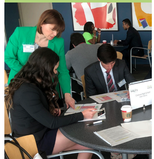
Credit Union Financial Advice